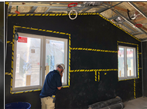
Blok-16®, Easy to Install in Walls, Floor & More