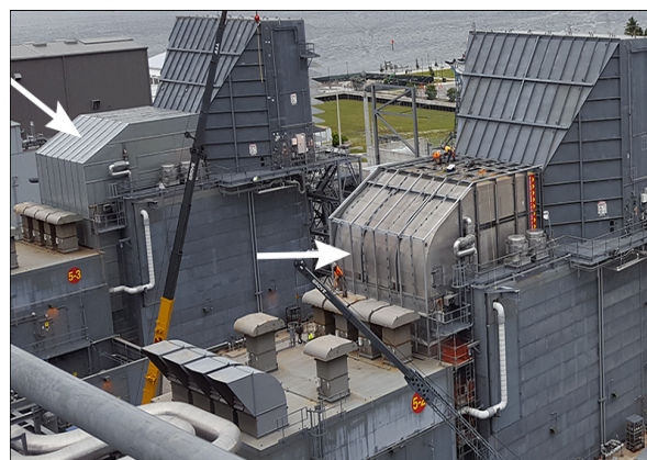
ALL WEATHER SOUND PANELS QUIET POWER PLANTS