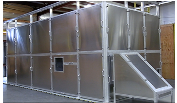
All Weather Easy Access Noise Enclosure