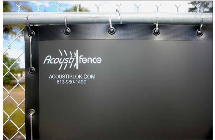
(Patented) Portable Acoustifence®