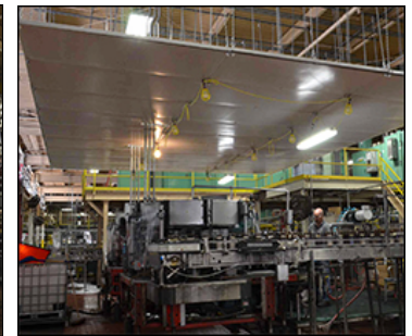
12 dB Noise Reduction with Quiet-Clouds®